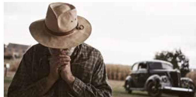
Lies Beneath the Nightshade