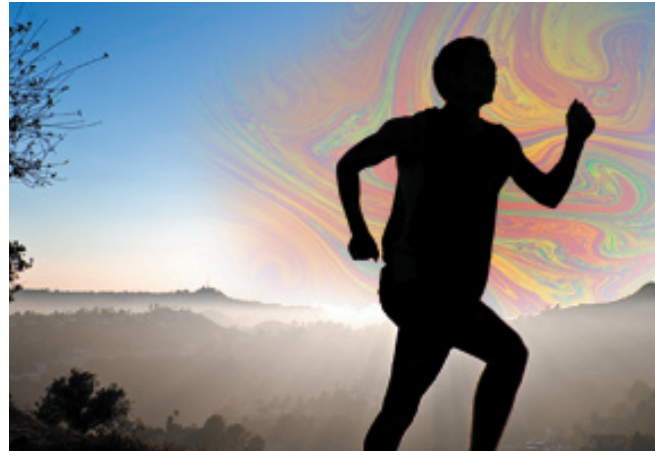
“Fuel”—3rd Place in Features