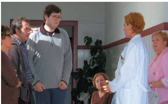
"A Xinecologa"—5th Place in Short Drama