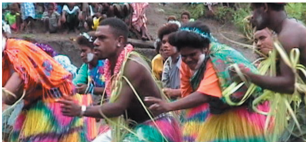
“God is an American”—4th Place in Documentaries